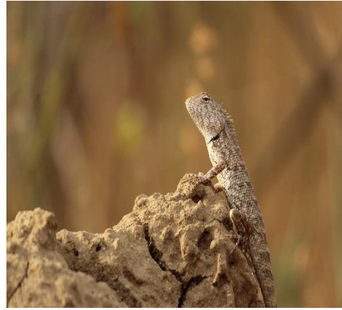
Fig 1 – Winners of Photography competition