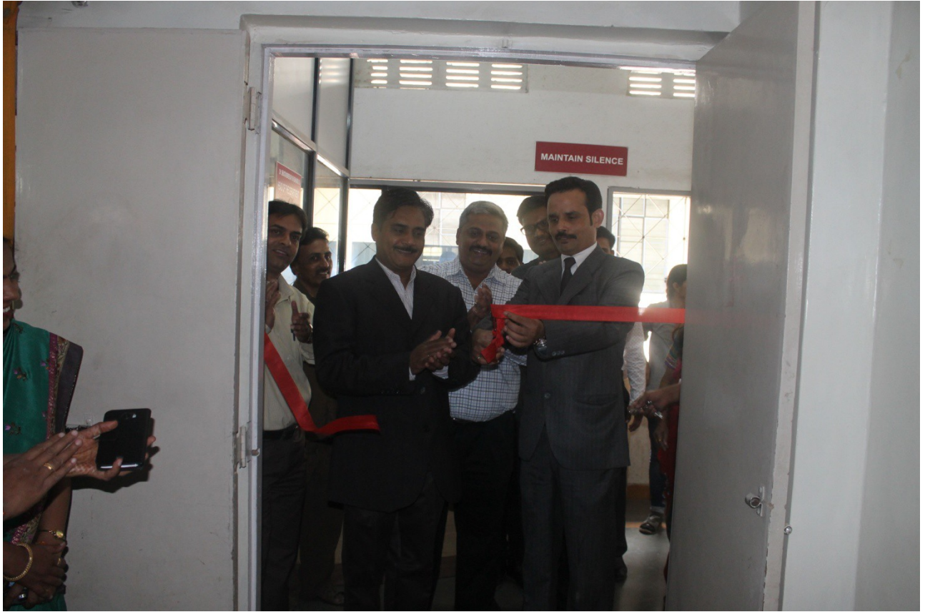
Inauguration of Interaction 2014 1 st Online Programming event by our Chief Guest