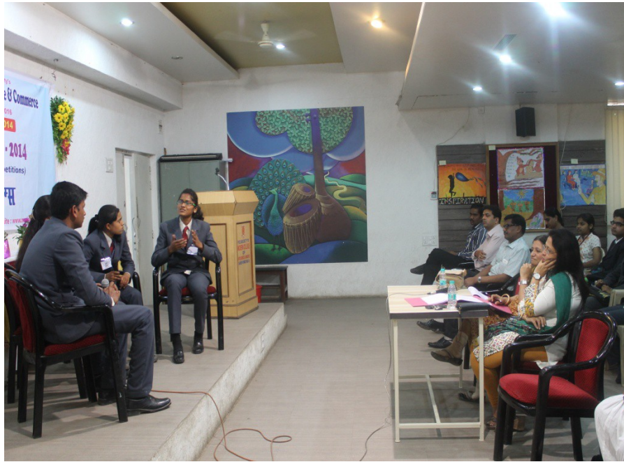
Students at Group Discussion