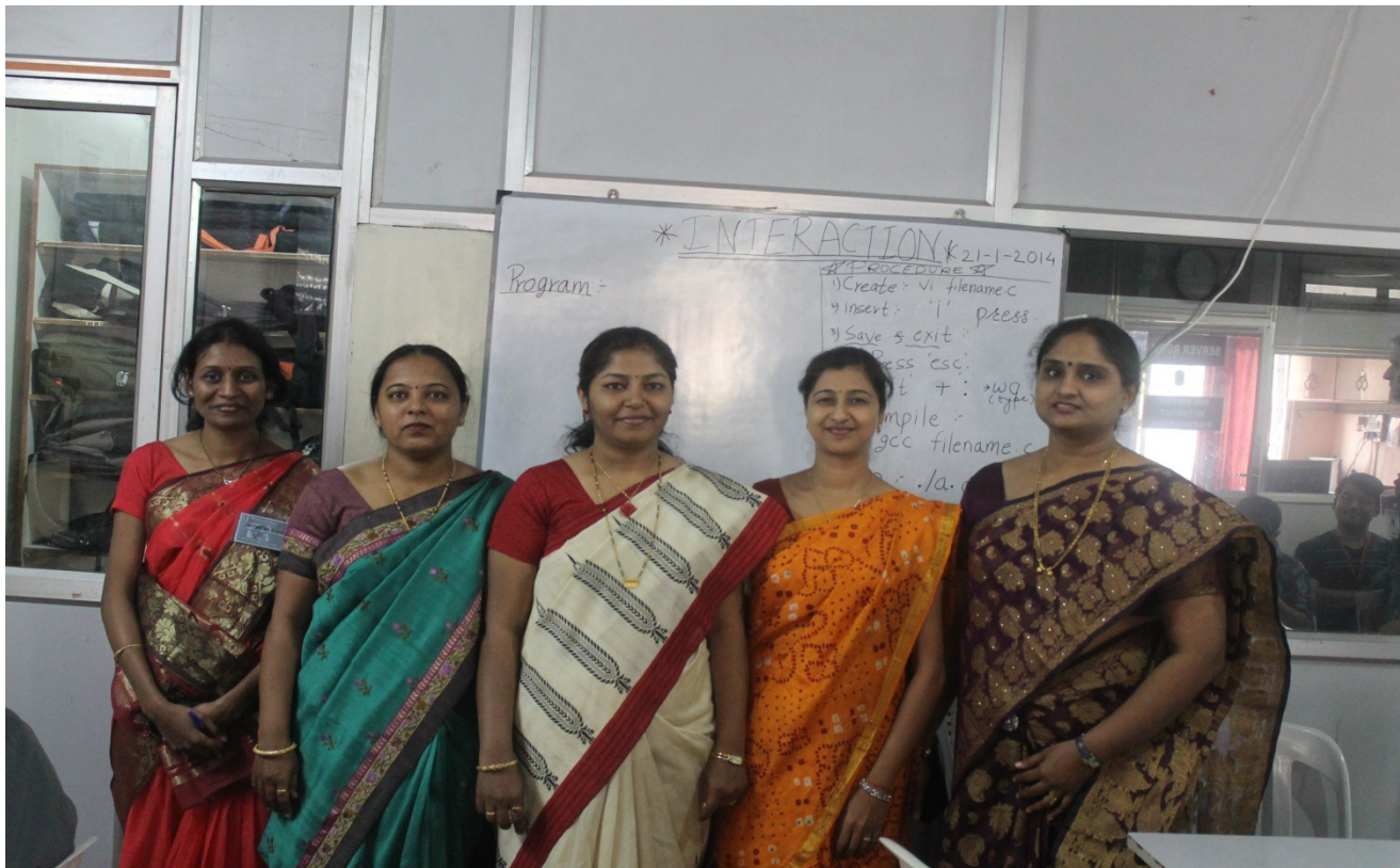
Judges of Online Competition ( PG & UG )