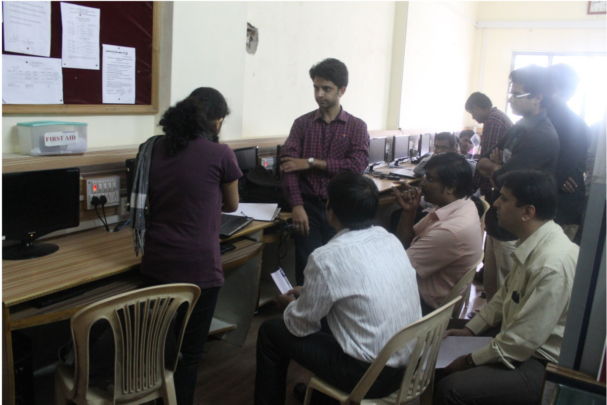
Judges of Project Competition Examining the projects of PG