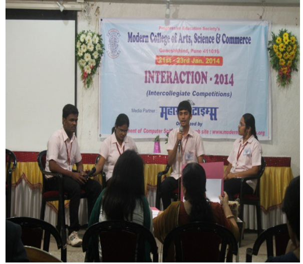
Guest Discussion at Group Discussion Competition