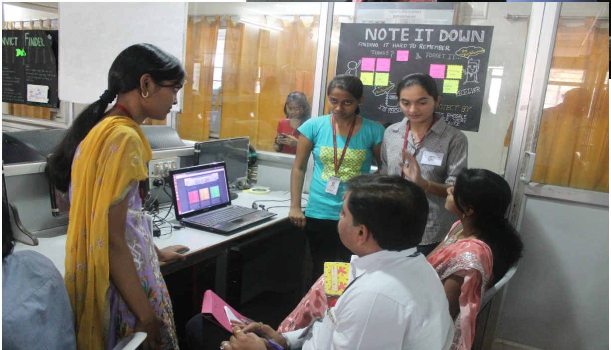
Judges of Project Competition examining the projects of UG