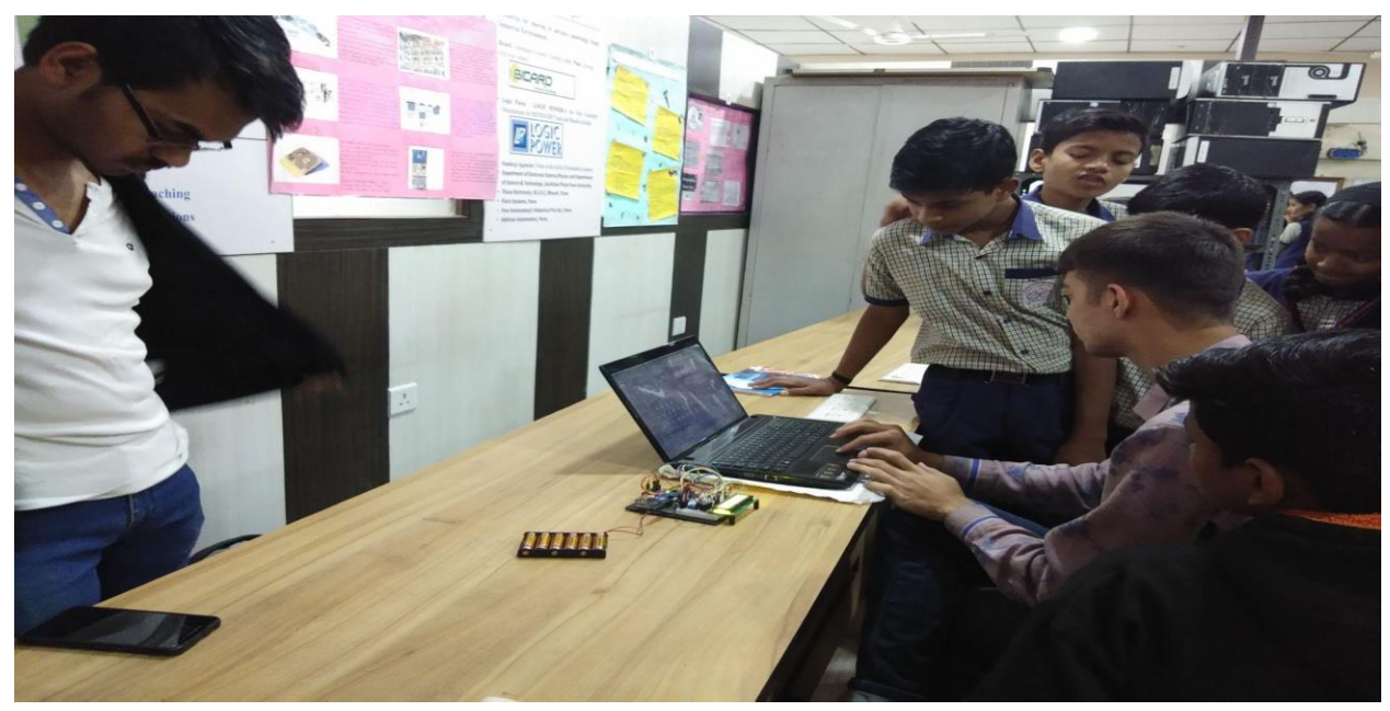
Modern College Science Association (Anubhuti): Science Popularization (2018-19)