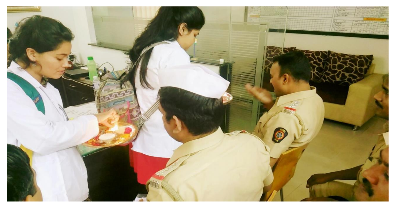
Indian Red Cross Society: CPR training and Rakshabandhan festival 8/27/2018