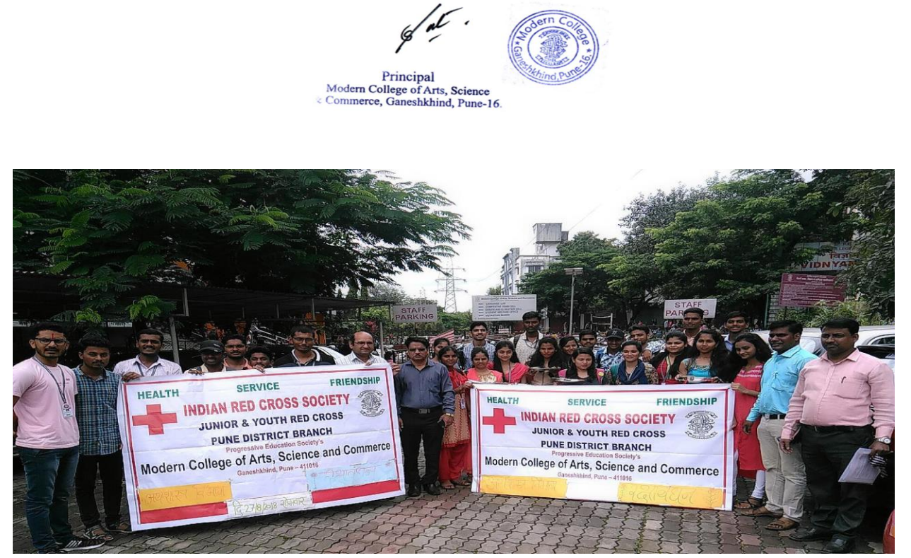
Indian Red Cross Society: CPR training and Rakshabandhan festival 8/27/2018