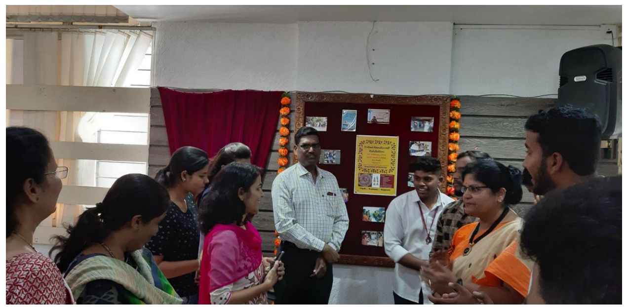
Modern College, Ganeshkhind with IDEAS NGO: Tribal Handicraft Exhibition (2018-19)