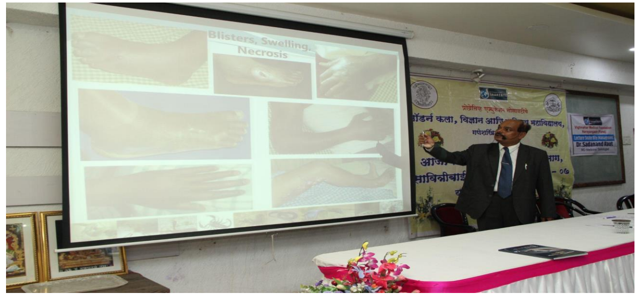
Modern College&Department of Life long learning and extension, SPPU, Pune: International Snakebite Awareness Day 19th September 2018