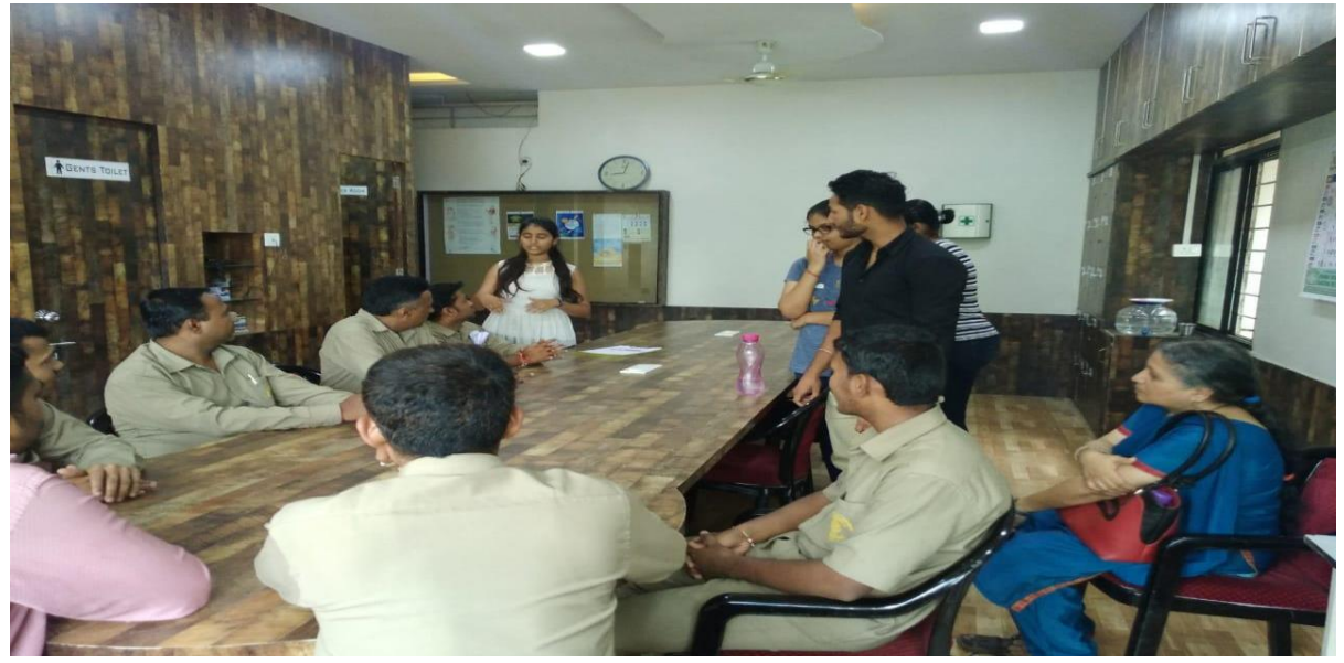
Modern College, Ganeshkhind: Social Responsibility: Ummeed (Addressing the importance of Mental Health)10th September 2018