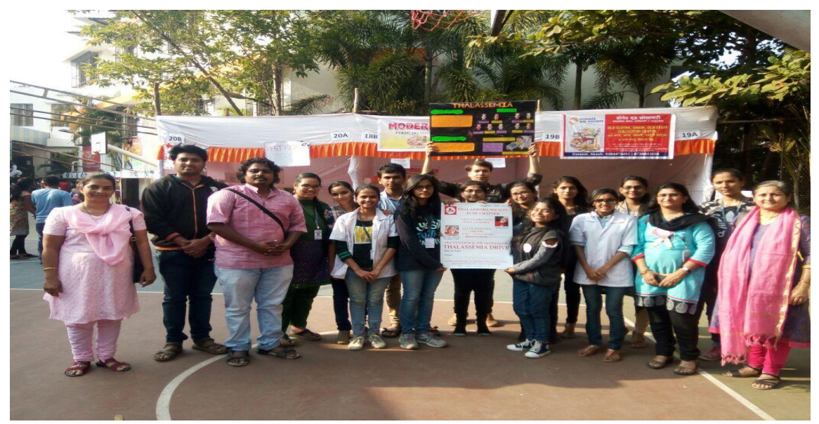
Thalassemia - awareness drive 18th August 2018