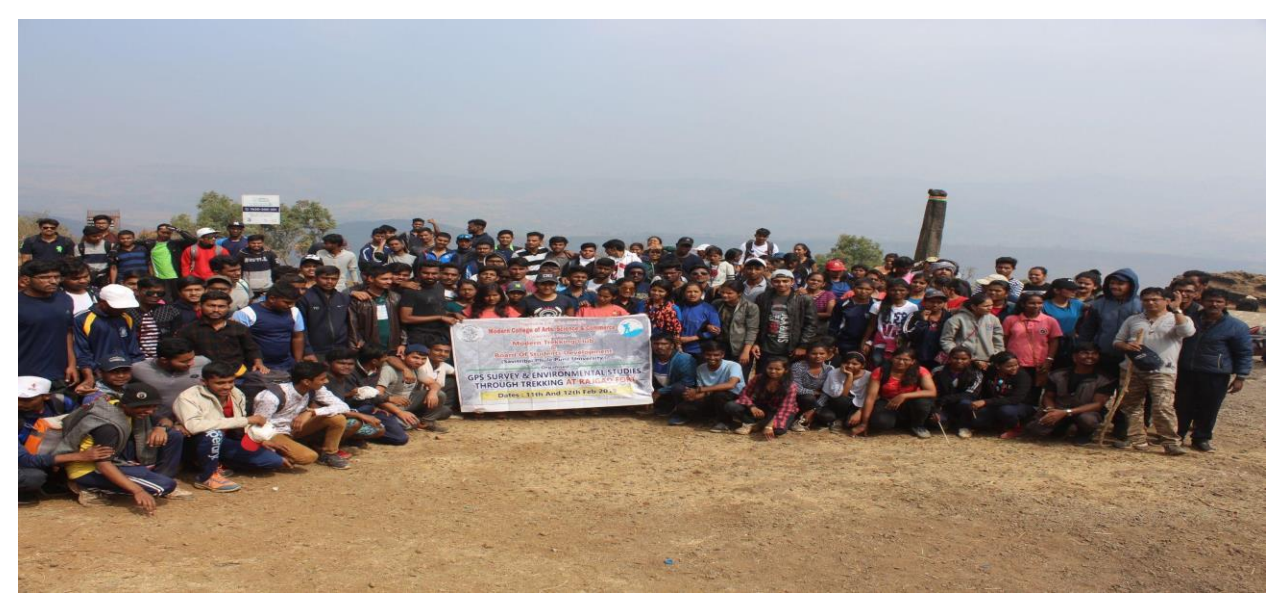
Modern Trekking Club (Rajgad Fort),11th 12th February 2019