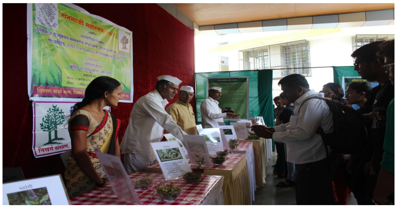
Ranbhaji Mahotsav 8th & 9th September 2018