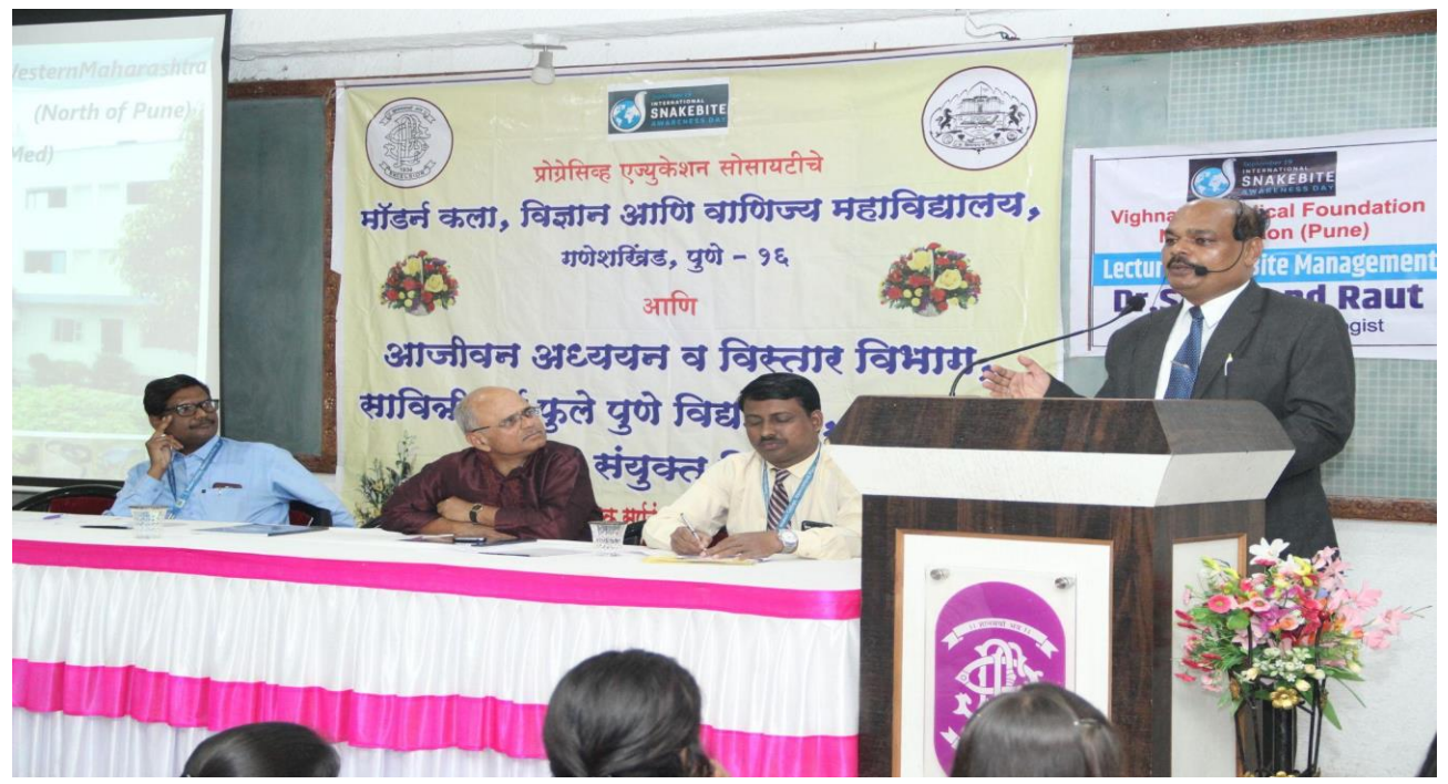
Modern College&Department of Life long learning and extension, SPPU, Pune: International Snakebite Awareness Day 19th September 2018