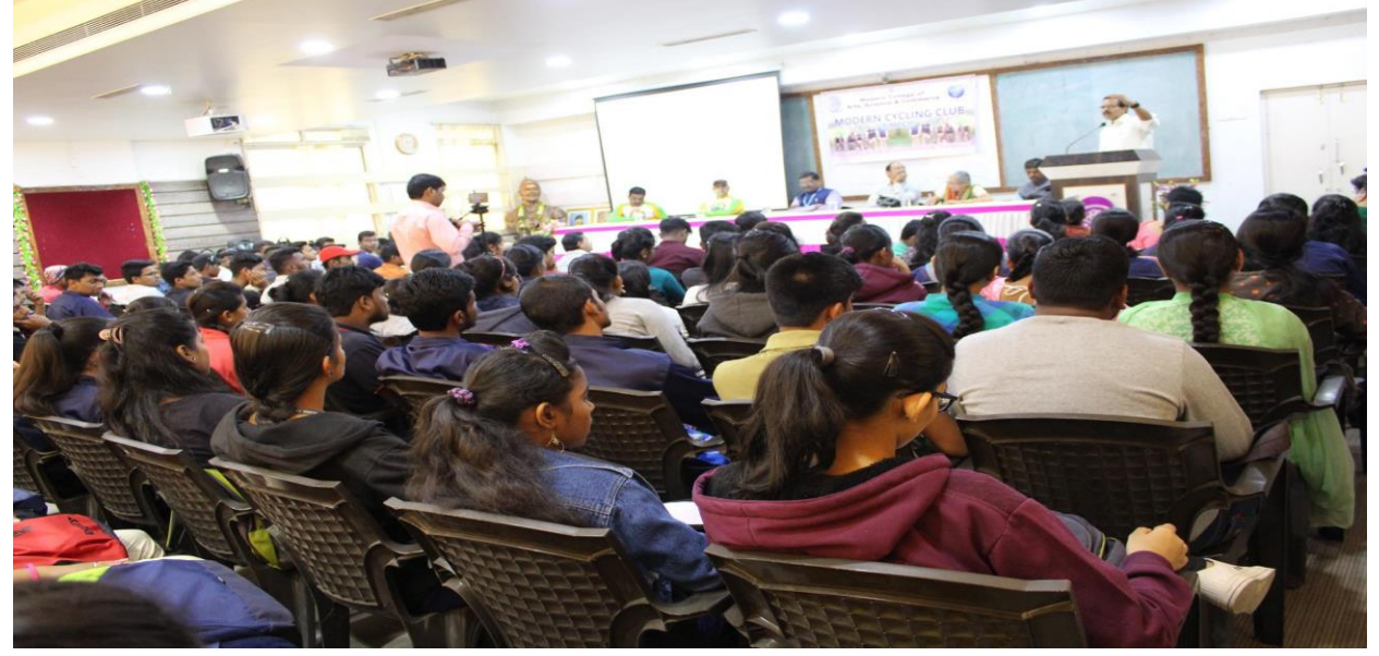
Modern cycling club inauguration (Geography) 2018-19