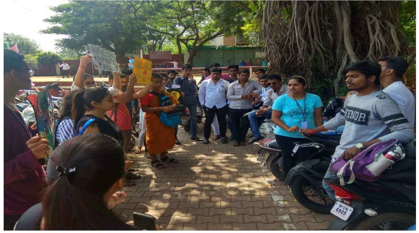
Department of Psychology, Modern College: 'Suicide Prevention Drive' (2018-19)