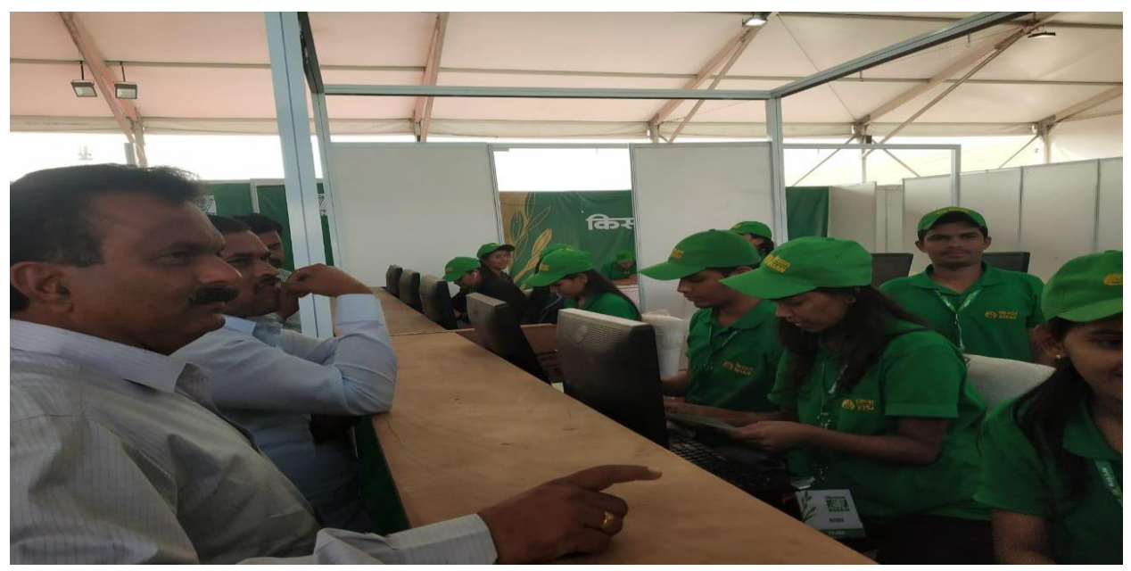
Student Volunteers at Kisan AgriExhibition 11th to 16th Dec. 2018

Principal Modern College of Arts, Science Commerce, Ganeshkhind, Pune-16.